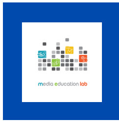
ML 5 critical questions tinyurl.com/MLCriticalQ