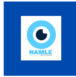
National ML core principles namle.net/resources/core-principles/