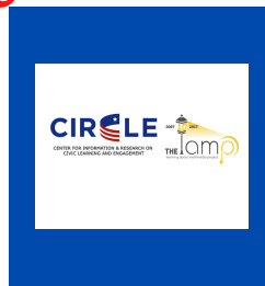
A toolkit for high school media making course rb.gy/elplmj