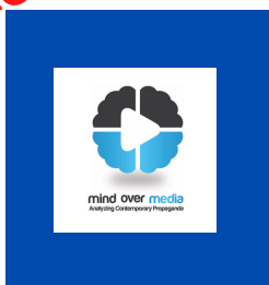
6 lesson plans for reflecting on persuasive current media texts mindovermedia.tv