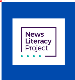
Tools for evaluating reliable access newslit.org/newslit-nation/#tools